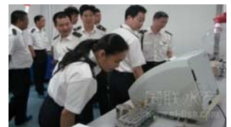
Officers from Zhanjiang Entry-Exit inspection And Quarantine Bureau visited the inspection center