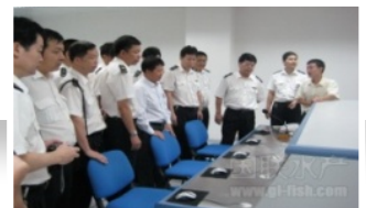
Officers from Zhanjiang Entry-Exit inspection And Quarantine Bureau visited the system center