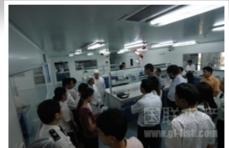
US FDA officers visited the inspection center

Feedback: "iQM has enabled us to manage and monitor the data from the raw materials to the finished product, and the automatic alert and regulation update functions greatly improved our efficiency and profit margin."